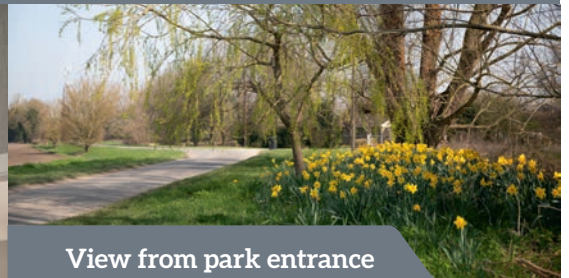
View from park entrance