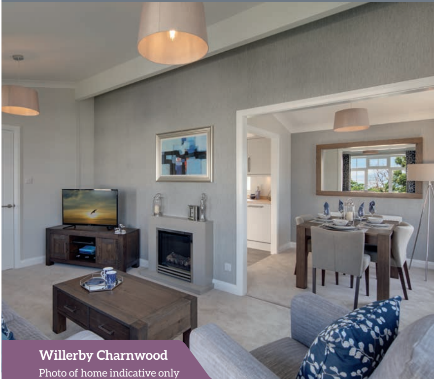
Willerby Charnwood Photo of home indicative only