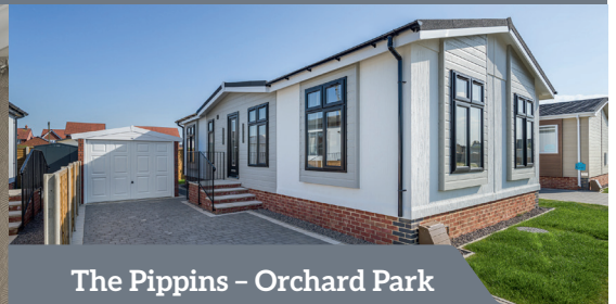
The Pippins - Orchard Park